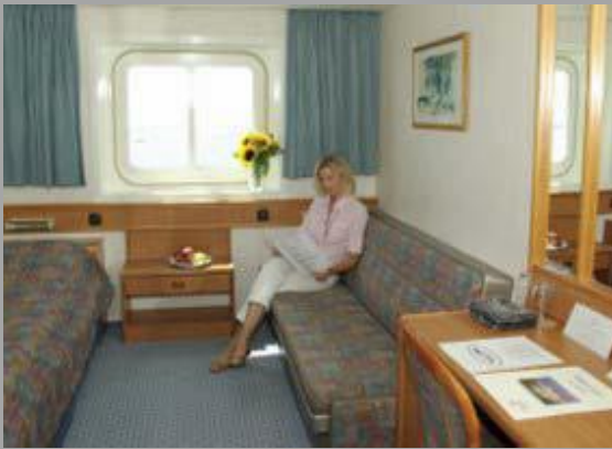
Standard Outside Cabin