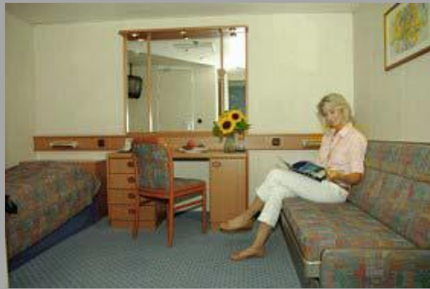
Standard Inside Cabin