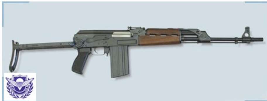
Standard Model Folding Stock