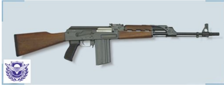
Standard Model Fixed Stock