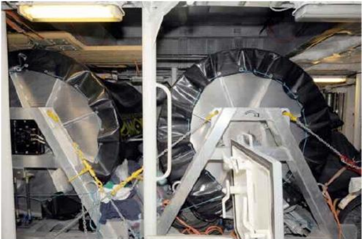
3 x 200 meter Oil booms can be stored in cargo hold