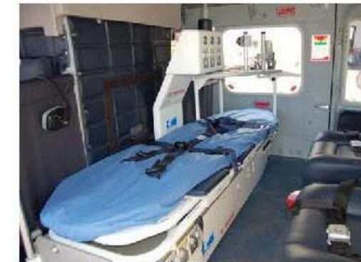
Single 2800 Series System Install