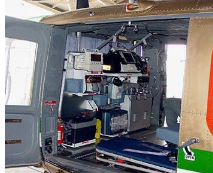
Examples of Air Ambulance Layouts