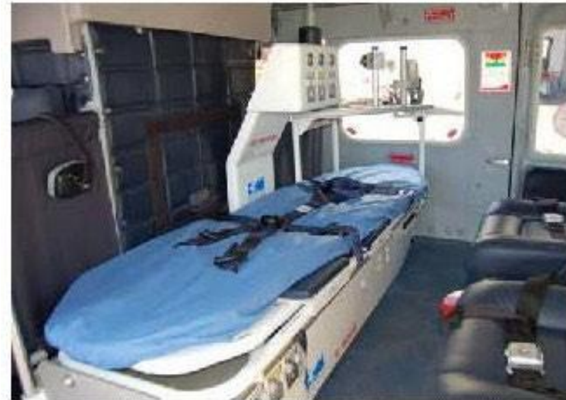
Single 2800 Series System Install