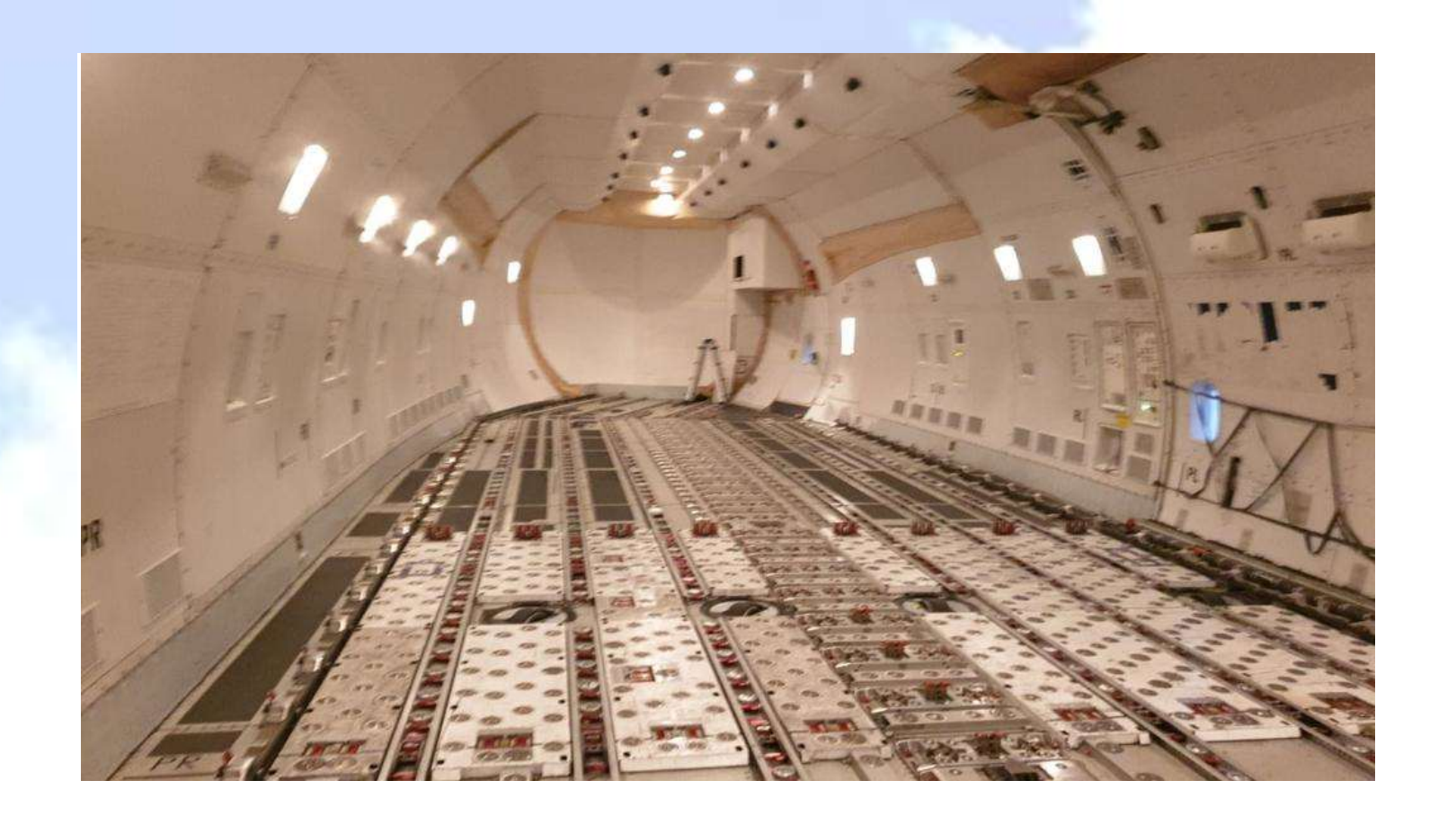
For Sale – Some trades considered.