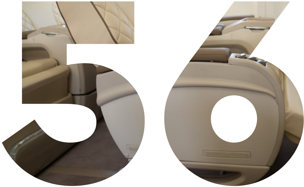
56 VIP / BUSINESS CONFIGURATION