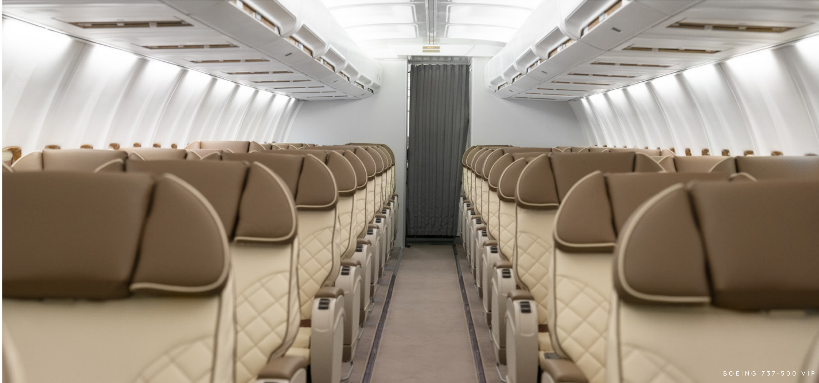
BOEING 737-500 VIP